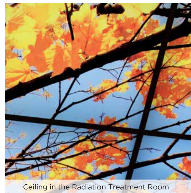
Ceiling in the Radiation Treatment Room