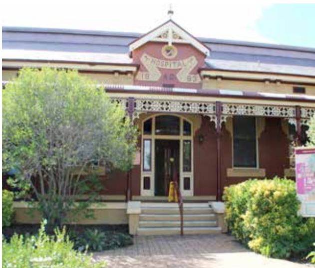
Old entrance Tamworth Hospital