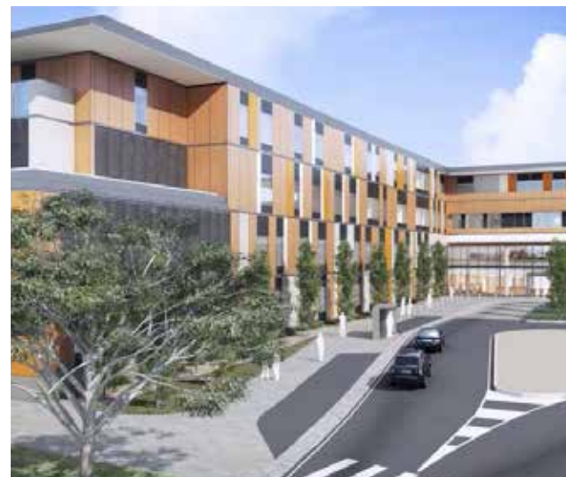
Main Entrance Tamworth Hospital