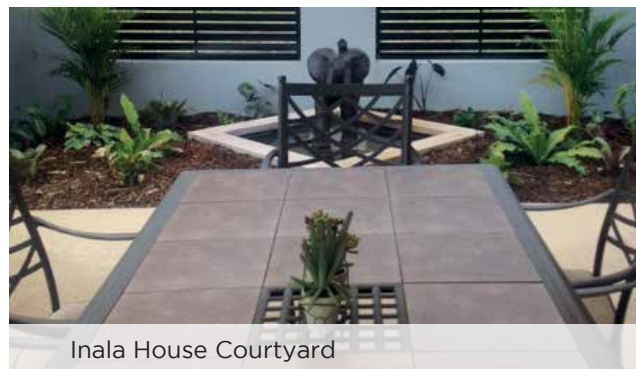
Inala House Courtyard