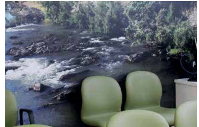
Oncology Waiting Room