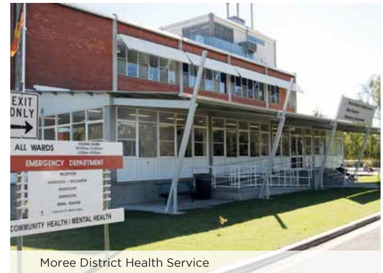
Moree District Health Service