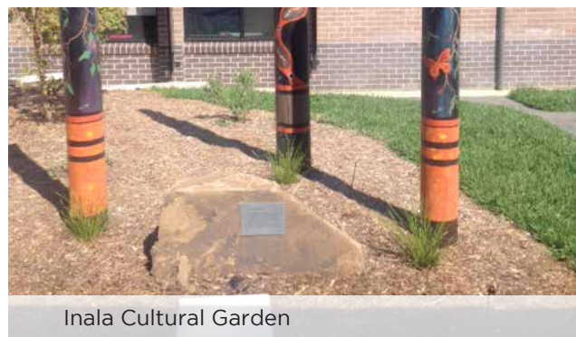
Inala Cultural Garden